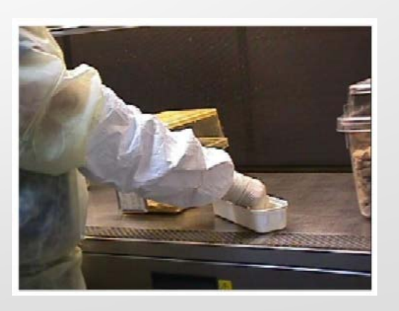
Click here for forceps tray video