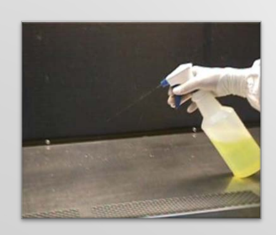
Click here for work surface preparation video