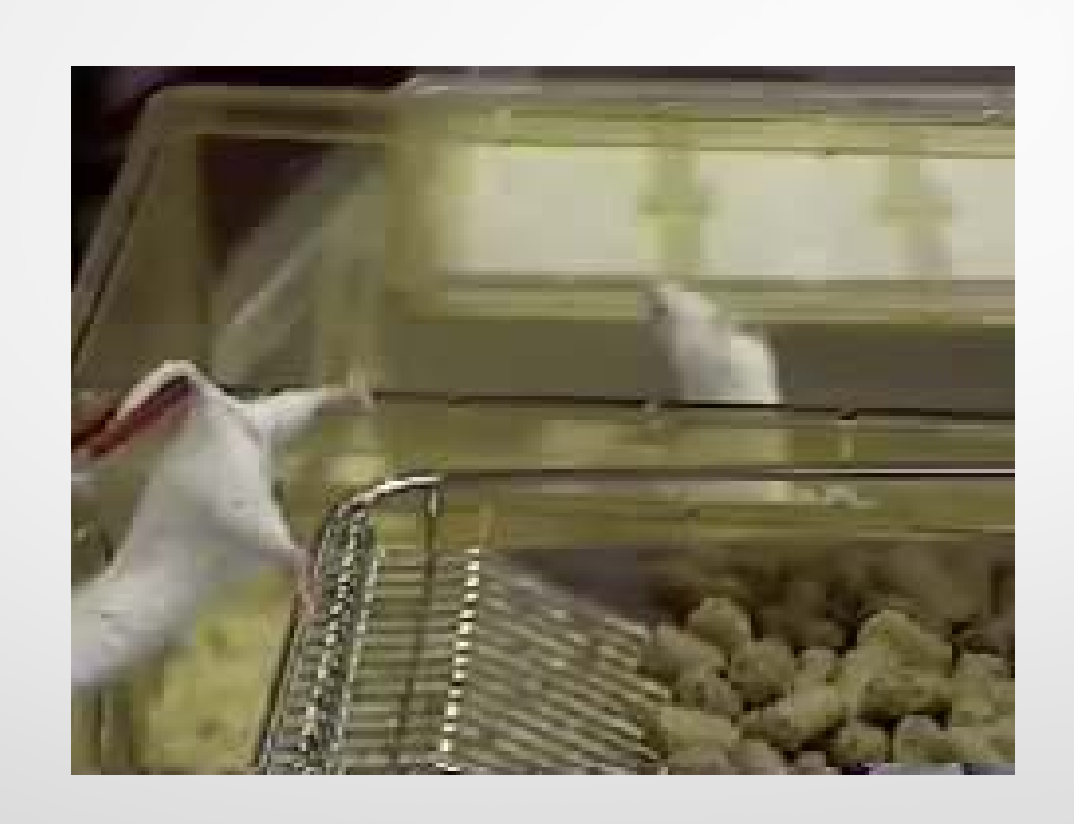
Click here for using forceps to transfer mice